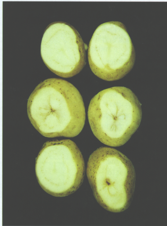
Potato tubers with Verticillium wilt symptoms.

An infested seed tuber usually carries the fungus on the surface or infected vascular tissue.