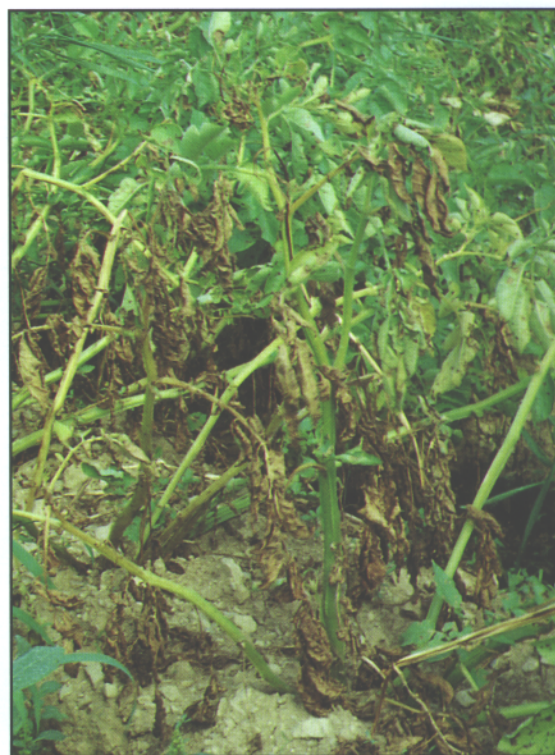
Foliar symptoms of Verticillium wilt.

The fungus infects the potato plant through the roots and invades the water-conducting tissues, which can result in a premature yellowing and death of the vine. Premature dying of the plant reduces yield. This disease is expressed more in plants under stress, especially water stress.