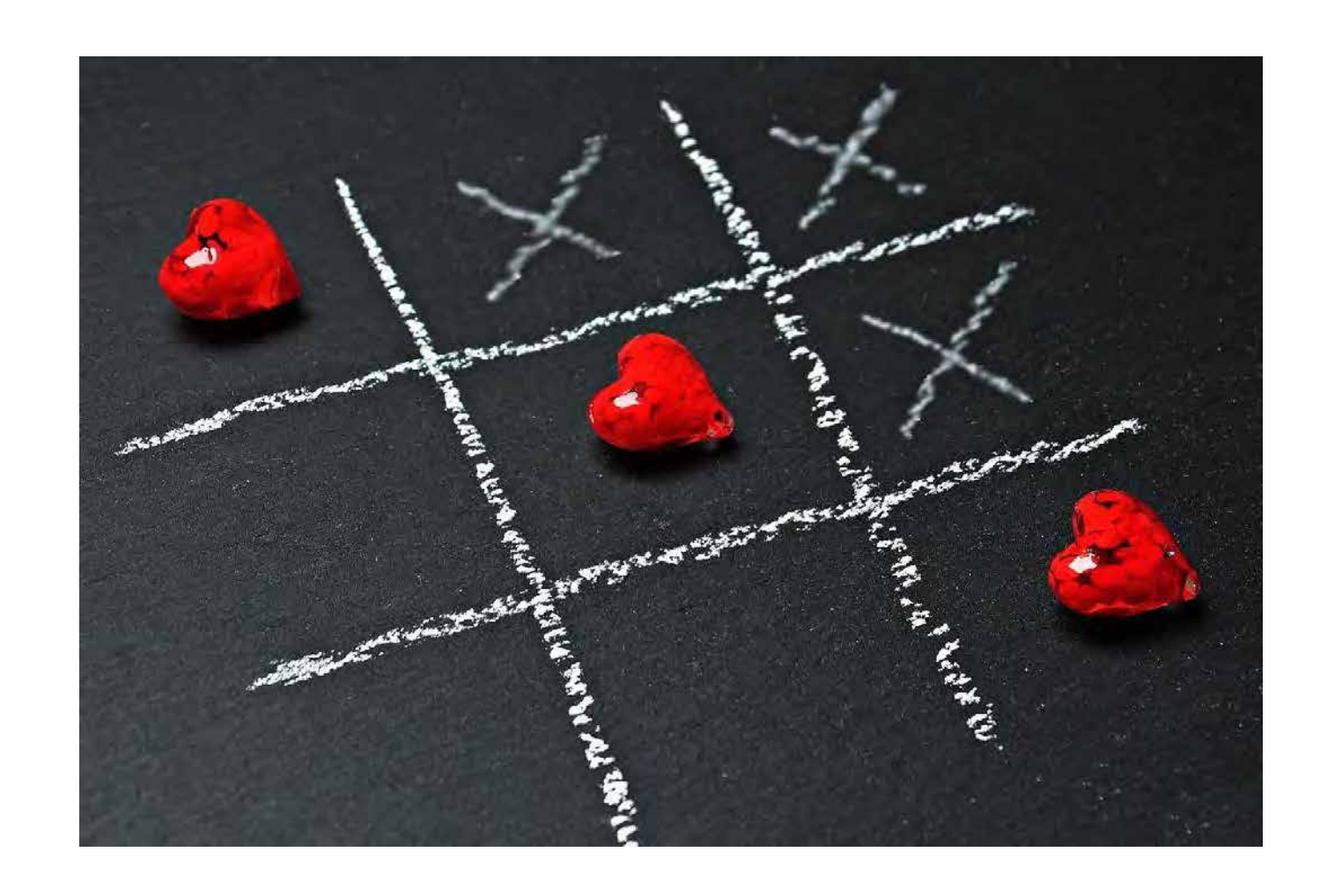
"My love of my life...When he is the one person you want to spend all of your time with ""