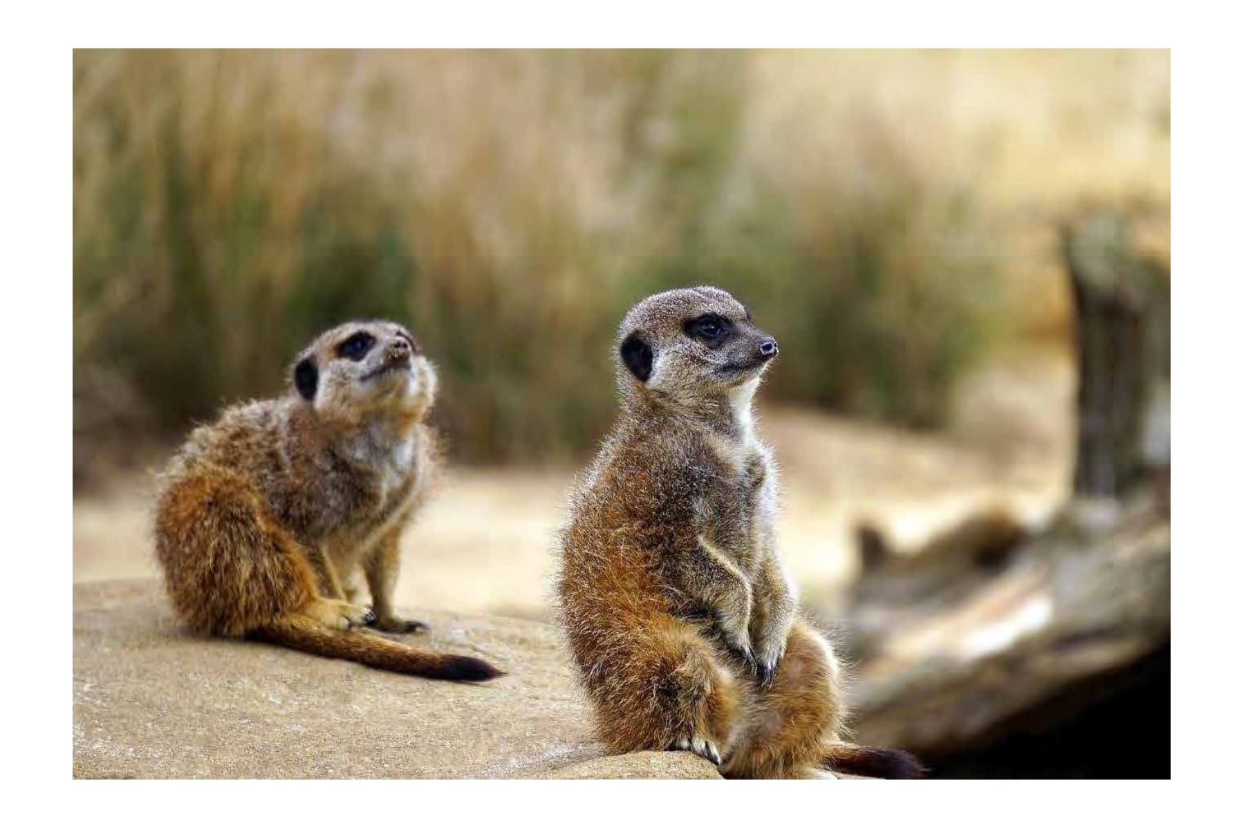
"You are the best thing that's ever been mine <3" -