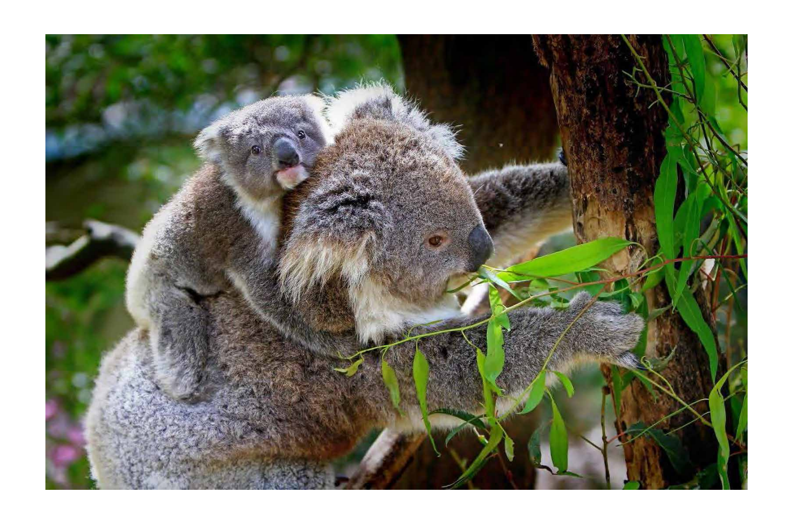
"Mom, everything I am, you helped me to become. -Thank you for being a role model."