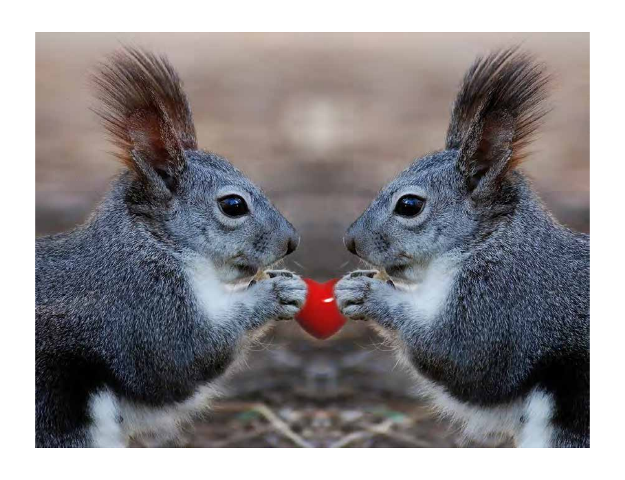
"Because you are my everything and you literally - complete me" -