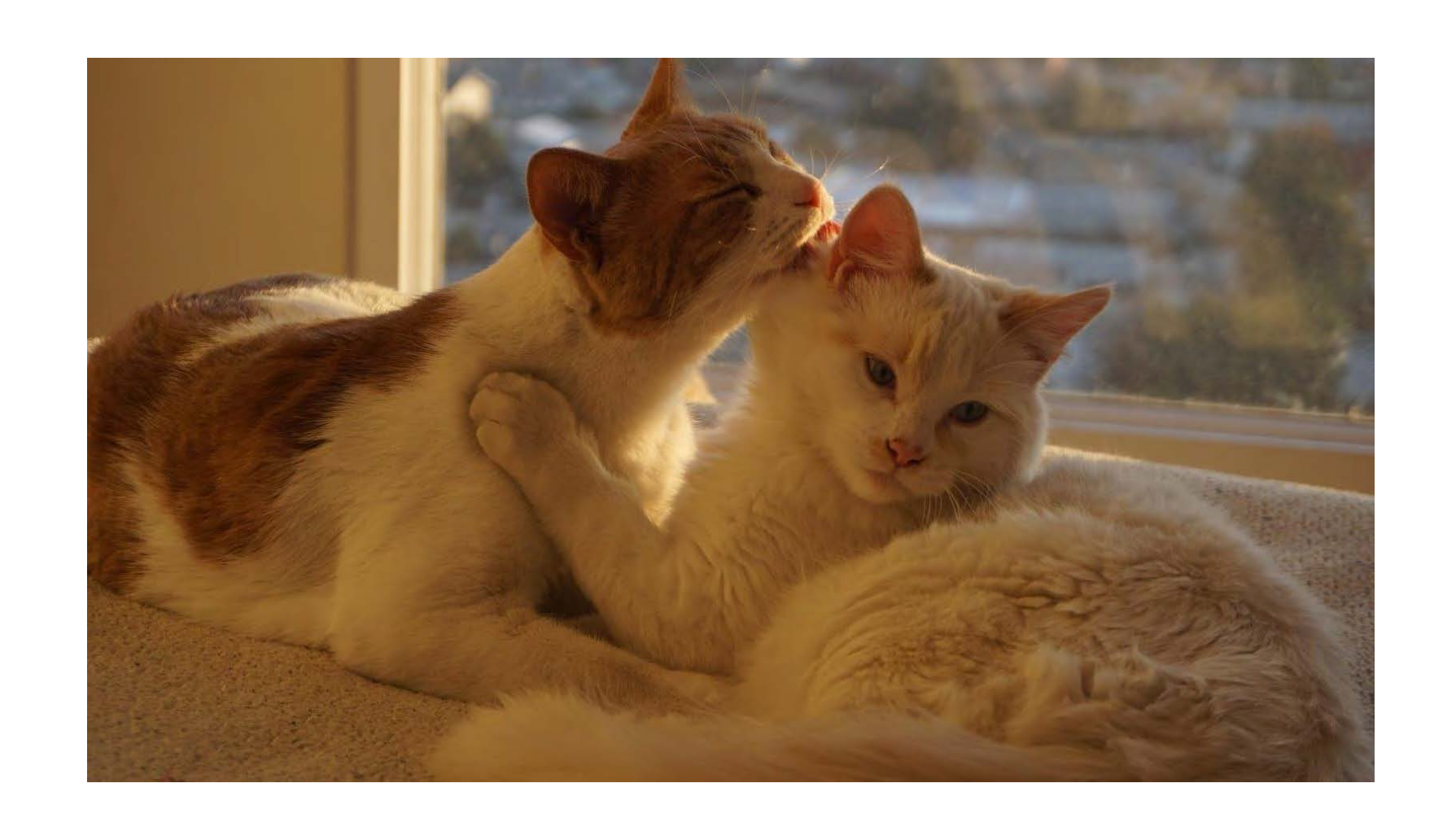
"Don't you ever dare put me second, when I put you - first." -