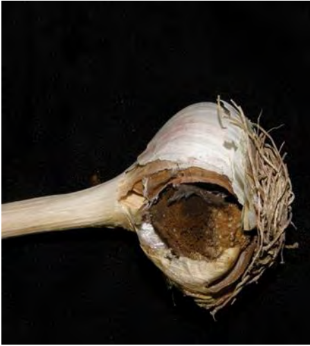
Black Mold caused by Aspergillus niger