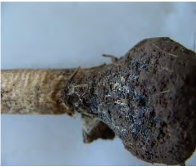
White Rot caused by Sclerotium cepivorum