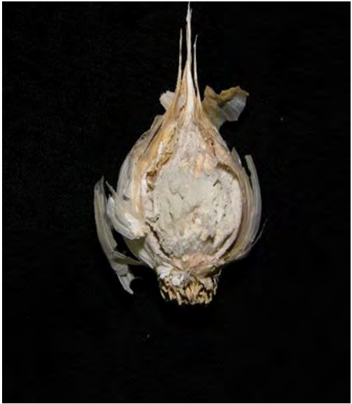
Blue Mold caused by Penicillium hirsutum