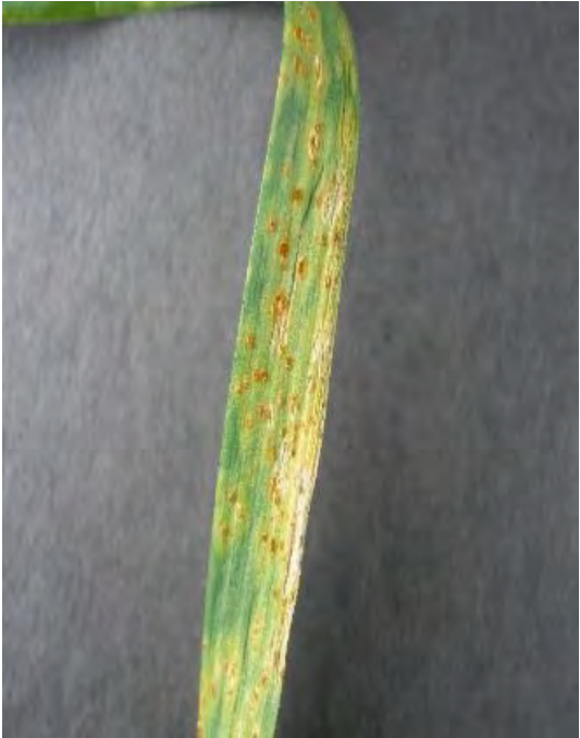
Garlic Rust caused by Puccinia allii