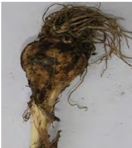
Mite damage, top and enlarged bulb mite, bottom