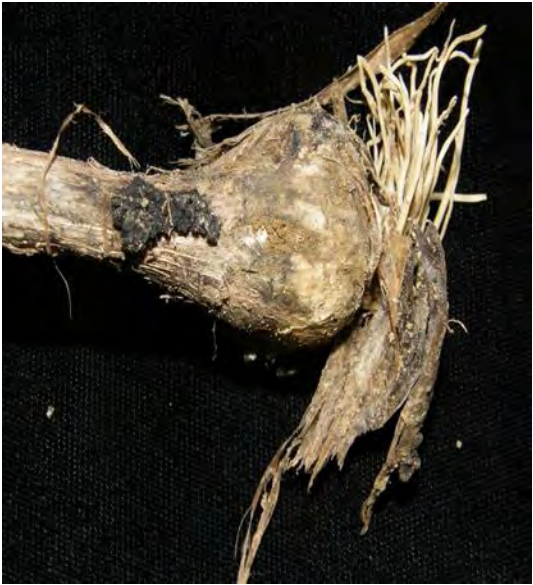
Neck Rot caused by Botrytis porri