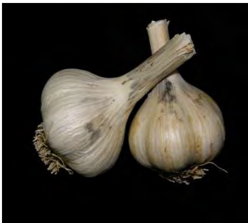
Embellisia Skin Blotch caused by Embellisia allii