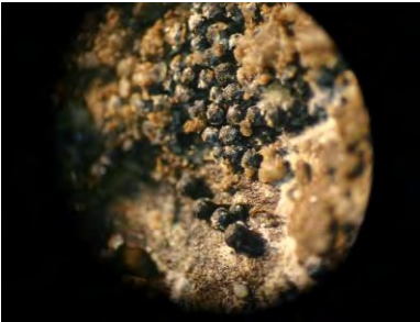
White rot sclerotia, enlarged