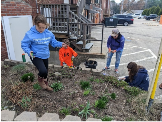
4-H members assist Homemakers and MGV in the corner garden behind the Extension office on Main St., Lisbon.

lead good lives at home and in their communities with innovative programming and services." Though small, the group has seen some growth including members that are atypical of homemaker groups in other parts of our state.