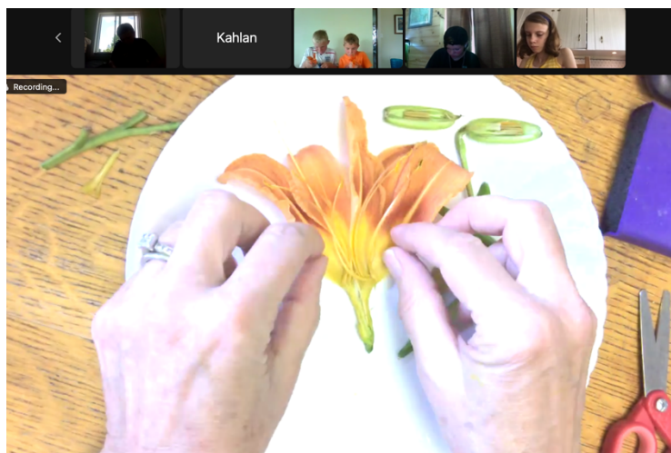
Learn to Love Pollinators workshop flower dissection. All participants had their own flower to dissect with instruction.

Maine 4-H offered the 4-H Summer Learning Series 2022, virtual programs for youth. Thirteen workshop topics were offered over the course of the summer. Many workshops were actually a series, and able to build upon learning and connection through multiple meeting times. Topics included pollination, citizen science, squid dissection, fiber arts, painting and more. An offline track was also offered, where activities were emailed weekly for young people to participate in their own time. Sessions were attended by 81 youth. Twenty-one percent participated in 3 or more workshops, coordinated by a team of 21 positive youth development mentors