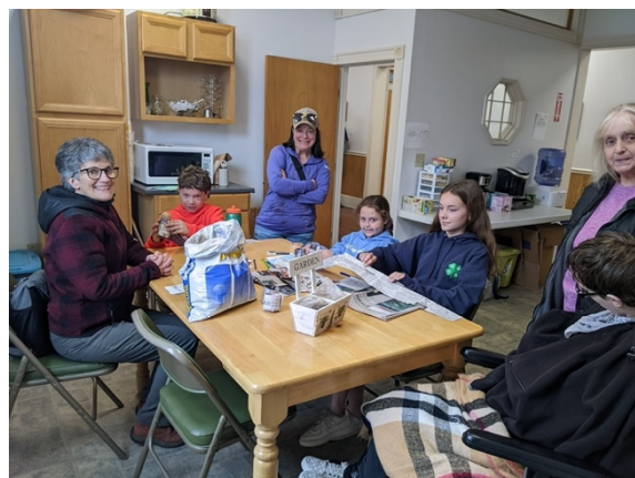
MGVs, Homemakers, and 4-H members making paper pots to plant chives seeds.

The Androscoggin Extension Homemakers Club has completed their first full year as a group and with great success. Named “Living Innovations Homemakers” and based at the Lisbon Extension office, the group meets monthly to learn a new skill, perform a community service, and enjoy the camaraderie of fellow members. Living Innovations is a 501(c)(3) that partners with families in Maine and surrounding states to “support people with intellectual and developmental disabilities to