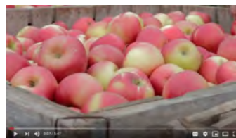
Growing Maine—Treworgy Family Orchards