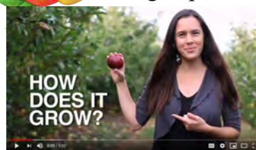
APPLE: How Does it Grow?