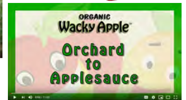
Wacky Apple Educational Video