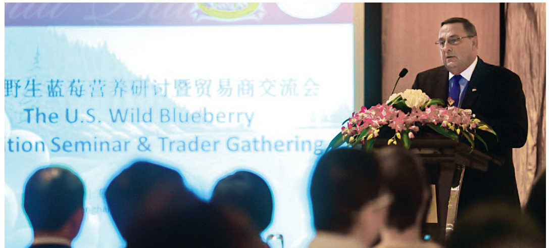
Governor Paul LePage spoke about the value of Maine's agricultural production and developing business relationships between Maine and China at the Wild Blueberry Association Nutrition Seminar in Shanghai.