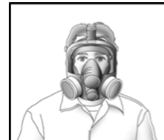
Full-facepiece air-purifying respirator*

Whenever a respirator is required to be worn by the pesticide product labeling, the correct respirator specified by the label must be used. Prior to using a respirator, the handler employer must provide the handler with the following: