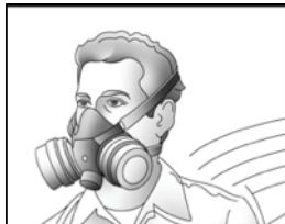
Half-mask air-purifying respirator*