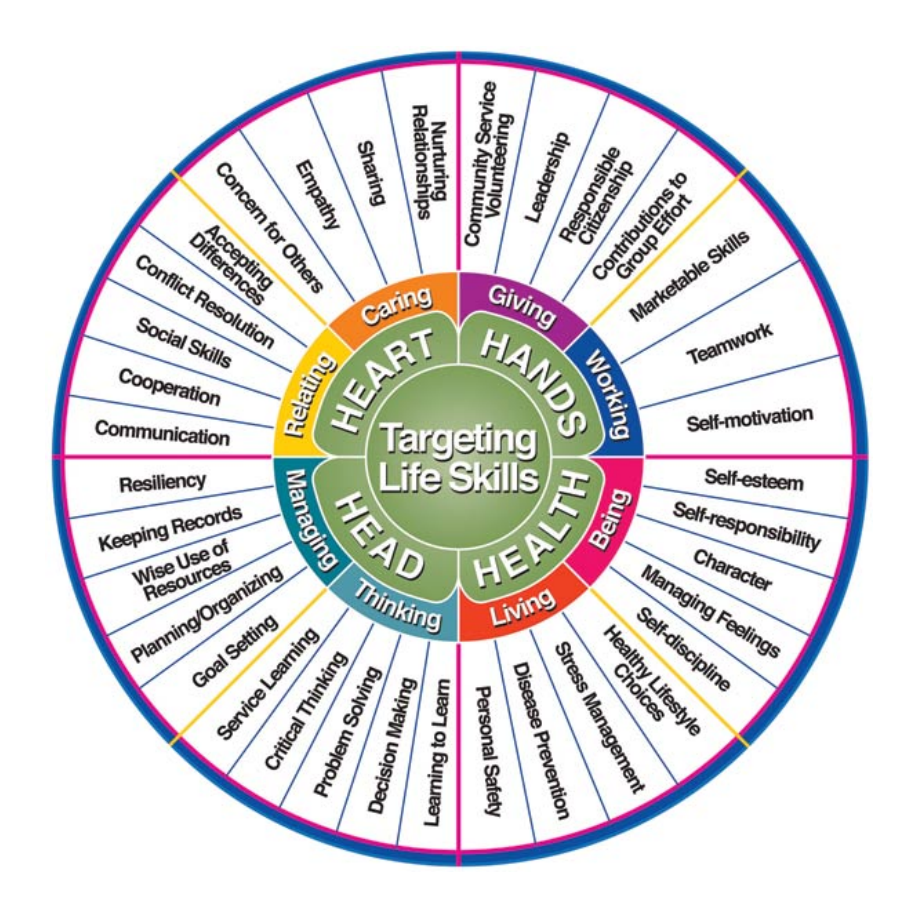
Section 1: Hands, Heart, Head, & Health

Section 2: Caring, Giving, Working, Being, Living, Thinking, Managing, & Relating