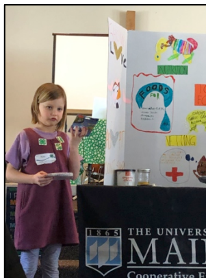
Ruby - Cat Care