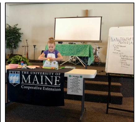
Olivia - Peanut Butter Pitas