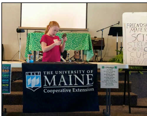
Abigail - Friendship Bracelet