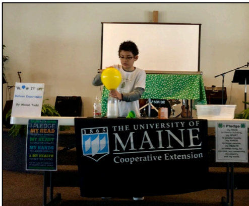
Mason - Blow It Up