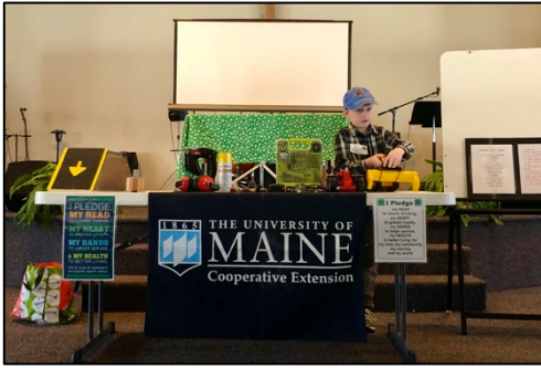
Wyatt - Building a Snowplow Attachment for your Toy Skid Steer