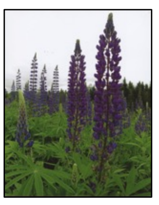
Judge's Choice - "Highlighted Angles" and "Lupine Forest" were both submitted by Zoe Sikkel from Rails N' Trails. Congratulations Zoe!