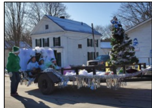
Be sure to check out our Facebook page for more 4-H photos - facebook.com/hancock4H