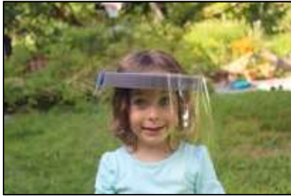
Submitted by Finn