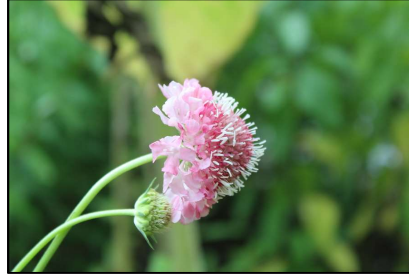
Submitted by Finn