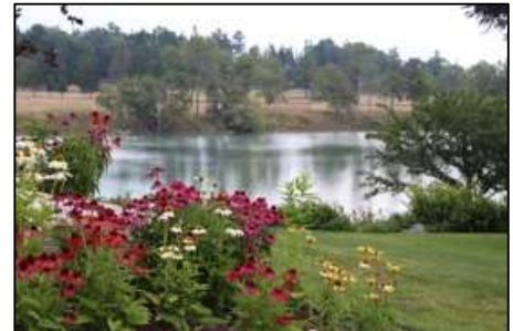
Submitted by Nayeli