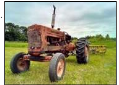
2020 Photo Contest Submitted by Zoe

Photo Contest Scavenger Hunt- Do you have a photo of your pet that you took this year that is just ... well... perfect? Don't be humble, you know it's great! You can submit it to this year's photo contest. To encourage all 4-Hers to participate in this year's contest, we are also creating a scavenger hunt based off the categories in the photo contest: animals, nature/landscape, people, architecture, and 4-H activities. There are some suggestions below if you need some inspiration. Here's the exciting part: all scavenger hunt participants will receive a ribbon AND a little "door-prize." If you take a photo of one item in each category, you'll be submitted into a raffle to win a larger prize. And if you choose to, you can submit any (or all!) of these photos to the 2021 Photo Contest. These photos get judged and the top score in each category gets a cash prize. If that's not incentive, I don't know what is! Go out and take some photos -- can't wait to see what you see! More information about the photo contest and deadlines coming soon.