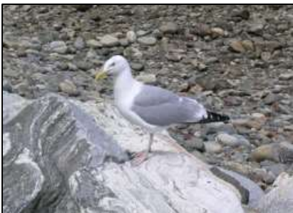
Submitted by Zoe