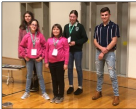
Livestock Participants at the Blue Hill Fair