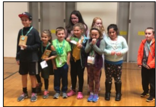
Jolly Juniors sold 1900 steer tickets and also sold the winning ticket!