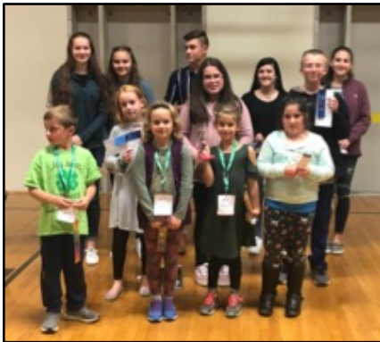
Project Record Participants