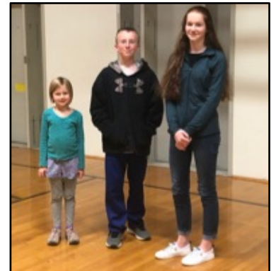
Best Project Winners at the Blue Hill Fair