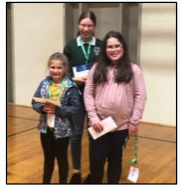
Photo Contest Participants