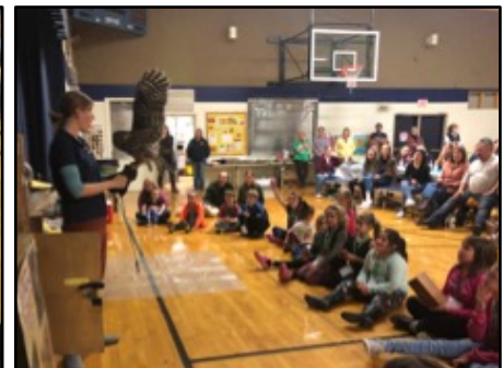
Chewonki – Traveling Natural History Program