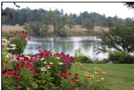
Left: Submitted by Nayelia