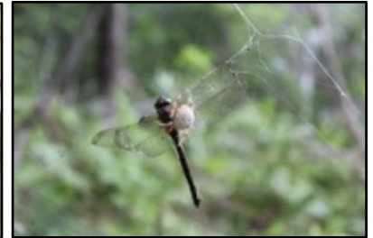
Submitted by Nayeli

Be sure to check out our Facebook page for more 4-H photos – facebook.com/hancock4H