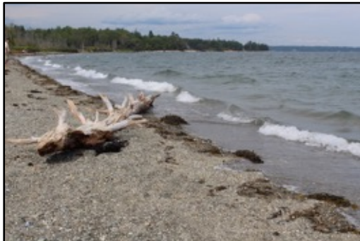
Left: Submitted by Finn