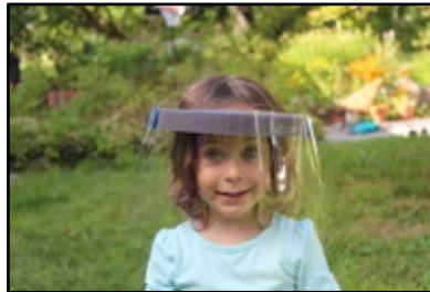
Submitted by Finn