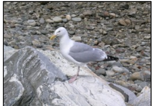
Right: Submitted by Zoe