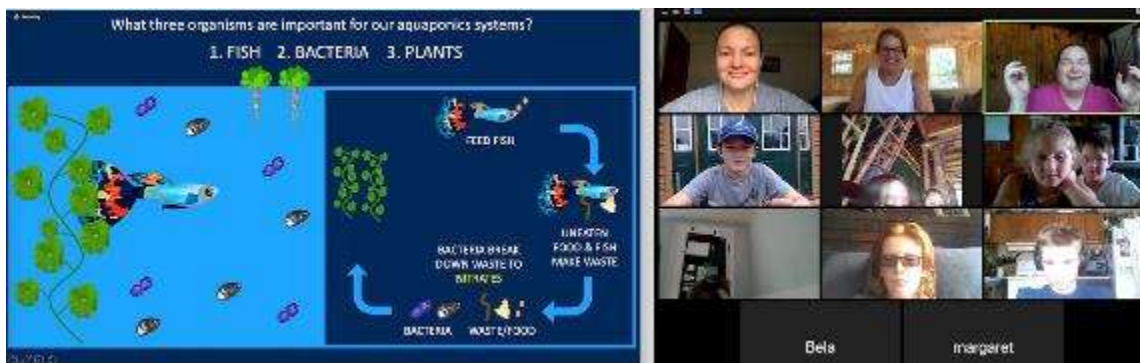
4-H Aquaponics Project virtual meeting. Youth are in the process of designing their own home aquaponics system for growing fish and plants together.

Speak Up! Building skills and confidence through public speaking – August 18 & 20, 10-noon, must attend both sessions! Register by August 11.