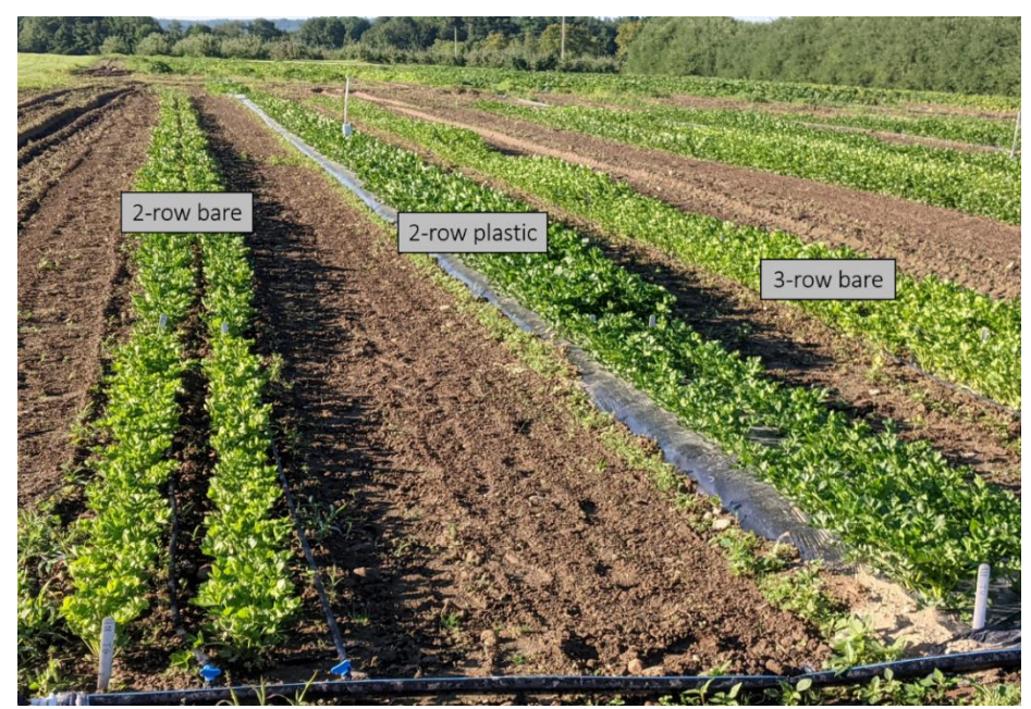
Figure 1. Highmoor Farm celery planting, Aug 3 2021, showing three planting systems: 2-row bare ground, 2-row plastic mulch, and 3-row bare ground.

Seedlings were transplanted July 17, 9.5 weeks after seeding, into beds that had been prepared three days prior with 500 lb/ac of 10-10-10 fertilizer incorporated. Three planting systems were evaluated as main plot factors in a split-plot randomized complete block design, and cultivars were subplot factors. The three planting systems were: 1) 2 rows on black plastic mulch, 2) 2 rows on bare ground, and 3) 3 rows on bare ground.