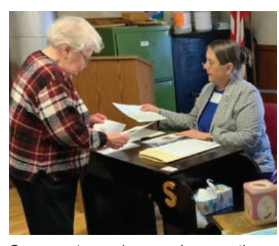
Somerset members spring meeting.