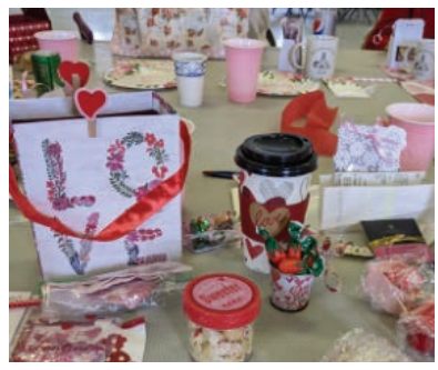
Cumberland members's Valentine luncheon.