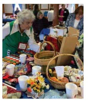
Somerset members spring meeting.

The York County Modern Day Homemakers spent January sewing, and February was "Tappin' and Sappin' and sledding, too! March was dedicated to learning about fruit tree pruning. The group is strong with 35 members, and we hope to get to meet some of the members of this phenomenal group at the Spring Meeting in April.