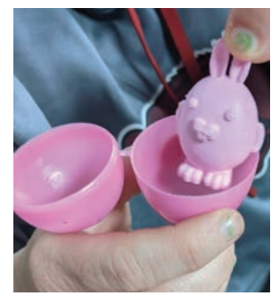
Androscoggin-Sagadahoc members filling plastic eggs.