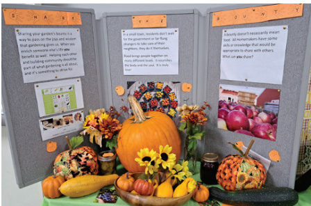
Another county homemaker display featuring the theme.

The 2023 annual reports need to be submitted by January 31, 2024 to county presidents.