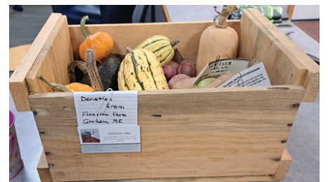
Share the Harvest.