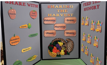
One of the county homemakers’ display featuring the theme: Share the Harvest.