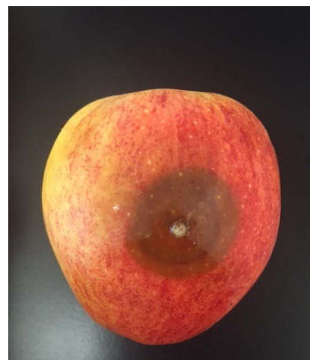
A Gala apple infected with newly described disease, Paecilomyces rot.

A new study, published online in March in the journal Plant Disease, describes for the first time a new apple disease, Paecilomyces rot, caused by the little-studied fungus. Though food scientists have attributed P. niveus in foods to soil contamination, the study's authors now think infected apples may be the true source.