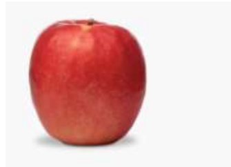
Pink Lady® Brand Barnsby