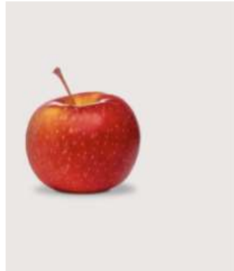
Evercrisp® cv MAIA 1 – MUST BE A MAIA MEMBER TO ORDER