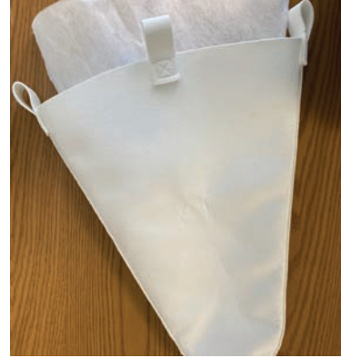
Cone Filter and Pre-Filter for maple syrup Cone Filter and inner Pre-Filter for maple syrup.

Syrup should be canned hot (between 180 to 195 degrees F) to sterilize the containers