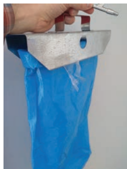
Sap bag with spile specific to this hanger type.