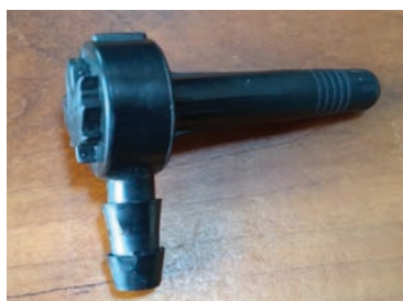
A 5-16 spile for tubing systems. Note the barbs for securing to the tubing.