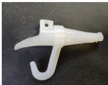
A 5_16 spile with a hook for hanging a bucket.