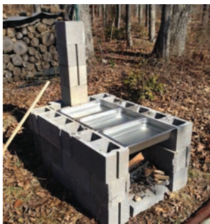
Catering pans on cinderblock setup.

A common first step to a designated evaporator is to convert a 50-gallon metal drum or 275 oil tank into an evaporator. The barrel or tank acts as the fire box, and are cut to allow for installing catering pans, or a sap pan for boiling. The sap should never come into contact with the barrel or tank.