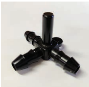
T-Fittings are used mid-lateral line to connect a drop line at each tapped tree.