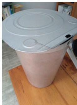
Aluminum bucket with lid.

Bag sap collection systems are relatively new. They consist of a metal bracket that hangs on a specialized spout. A food grade plastic bag is hung from the bracket and can be easily slid in and out of the bracket for sap collection. If using this system be sure that your spouts work with the bracket.