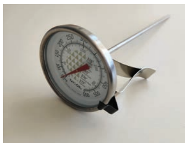
Long-stemmed candy thermometer.