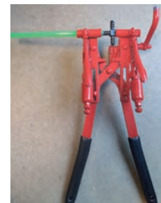
Two-handed tubing tool for grasping tubing, pulling it tight, and securing fittings.