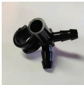
Hook fitting for wrapping tubing around an end tree at the top of the system.