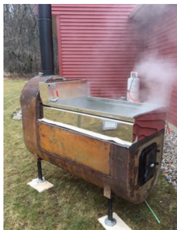
Oil tank evaporator.