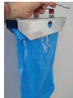
Sap bag with spile specific to this hanger type.