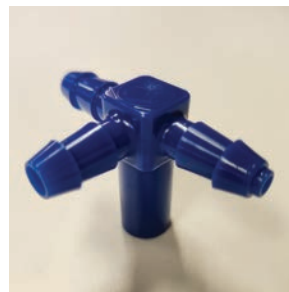
An end line t-fitting allows sap to run through both sides on the left, but not the one on the right, preventing sap from getting stuck behind the end tree.