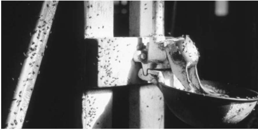
Flies on waterer