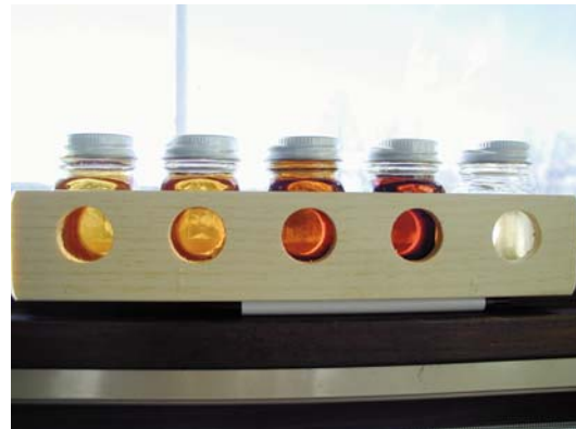
Grading is an important step in your production process. First, be sure that your grading kit is accurate, and right for your operation.

The lead content of most maple syrup is extremely low, even when made with lead containing equipment. However, the only way to know the lead content of your syrup is to have it tested. Maine testing services are available at the University of Maine. If tests show your syrup has lead levels within acceptable levels (below 250 ppb