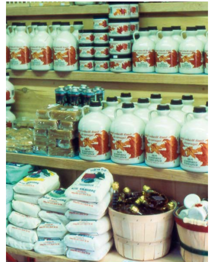
A variety of retail syrup product containers.