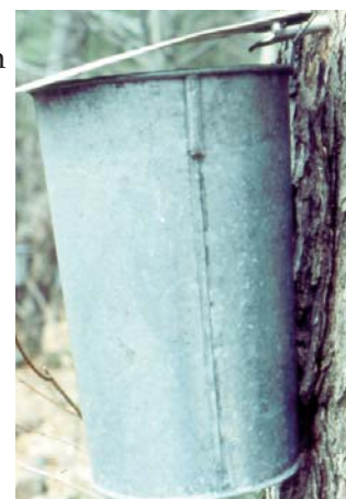
Sap gathering pail

No matter what piping you use, be certain that lines have no sags; sags trap the sap, and permit bacteria growth.