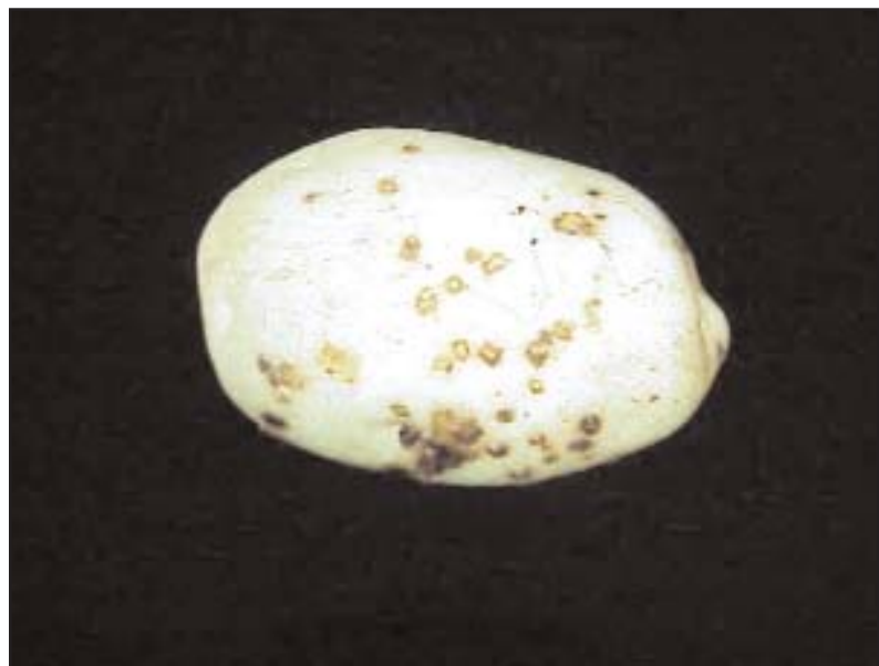
Potato tuber with powdery scab lesions

Eventually, secondary swimming zoospores can be released and then infect roots, stolons or tubers. Typically, these secondary zoospores infect developing tubers. These tuber infections develop into powdery scab