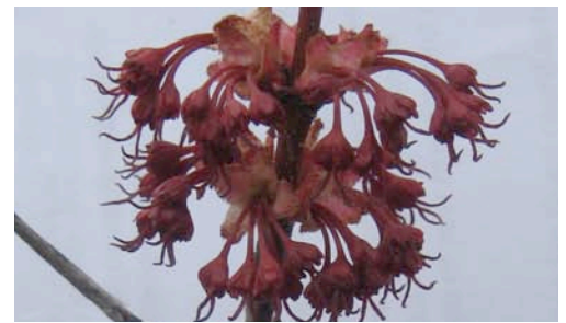
Red maple flowers (female). B. Bisson, ME Sea Grant