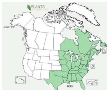
Distribution of Red Maple. USDA Plants Database

Bark: Young red maples have smooth, light grey bark. Bark on older trees is often broken into plates.