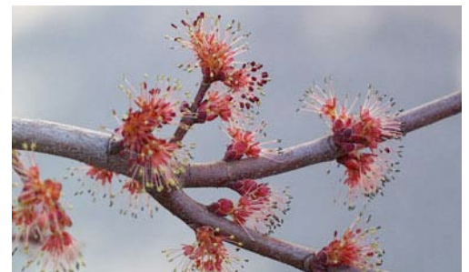
Red maple flowers (male)