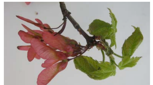
Red maple samaras with new leaves. B. Bisson, ME Sea Grant