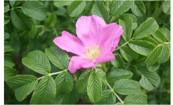
Rosa rugosa flower.

Gulf of Maine Research Institute, Invasive to Maine, Rosa Rugosa, http://www.gmri.org/upload/files/V5_Rosa_rugosa.pdf