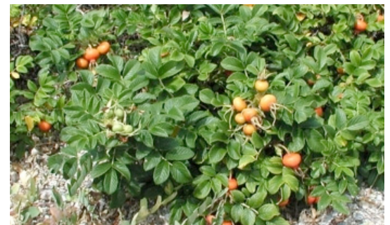
Rosa Rugosa hips