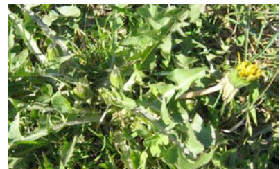
Dandelion with unopened flower buds.