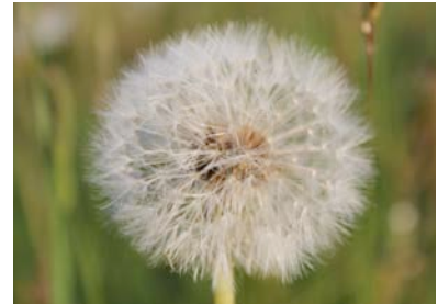
Dandelion seed head.