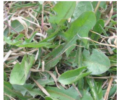
New dandelion leaf growth.

One or more live fully unfolded leaves are visible on the plant. For seedlings, consider only true leaves and do not count the one or two small, round leaves (cotyledons) that are found on the stem almost immediately after the seedling emerges. Do not include dried or dead leaves.