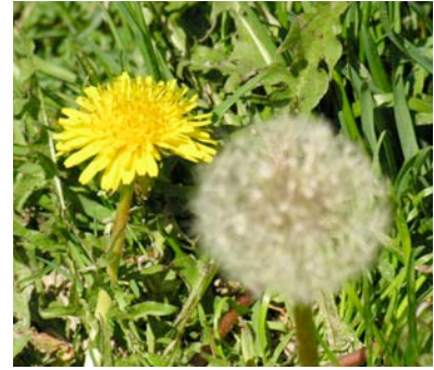
L. Stack, UMaine Cooperative Extension

As you report on phenophase status (Y, N or ?) on the datasheets, refer to the definitions on this sheet to find out what you should look for, for each phenophase in each species. To report the intensity of the phenophase, choose the best answer to the question below the phenophase, if one is included.