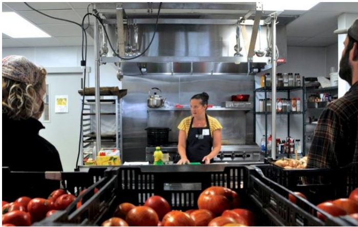
(UMCE staff leading preserving workshop at “Preserving Party”)

Waldo county staff worked with colleagues from across the state to offer monthly Preserving the Maine Harvest webinars in 2022 on a range of food preservation topics. Staff also offered live demonstrations at The Union Fair and The Common Ground Fair, taught in-person workshops at The Maine State Prison and at the Islesboro Community Center and co-hosted a “preserving party” at The Belfast Soup Kitchen in which attendees learned how to water-bath can tomatoes, dried tomatoes and froze over 100 lbs of gleaned tomatoes for use in the soup kitchen over the winter.