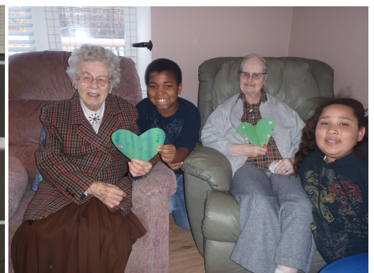
Members of the Princeton Pioneers with the Valentine's Day creations they made for the residents of assisted living facilities.