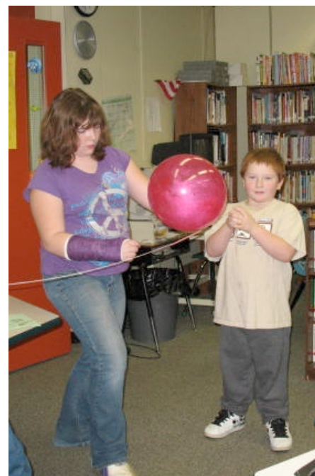
Members of Chandler River 4-H Club working on balloon rockets.