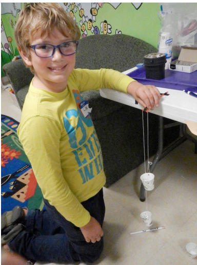
Will it Lift? Activity