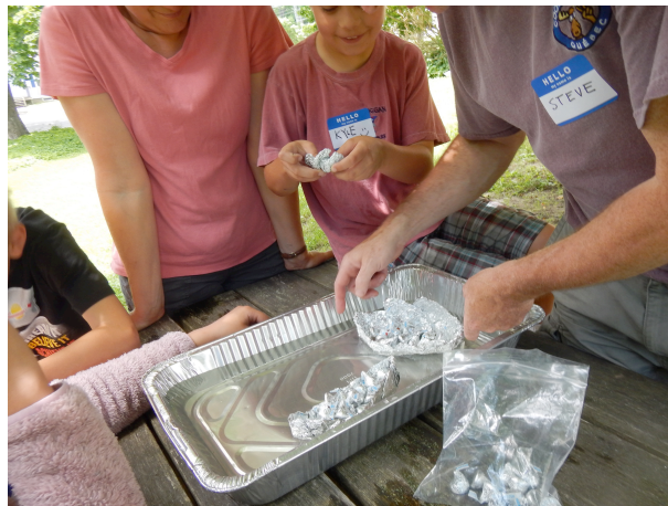
Will it Float? Activity